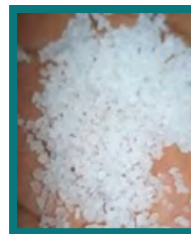
KITCHEN SALT 1.2 : 2.2 mm