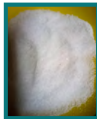
TABLE SALT 0.2 : 1.2 mm